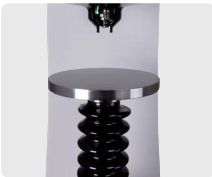
Round test table