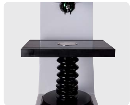
Extra large working table