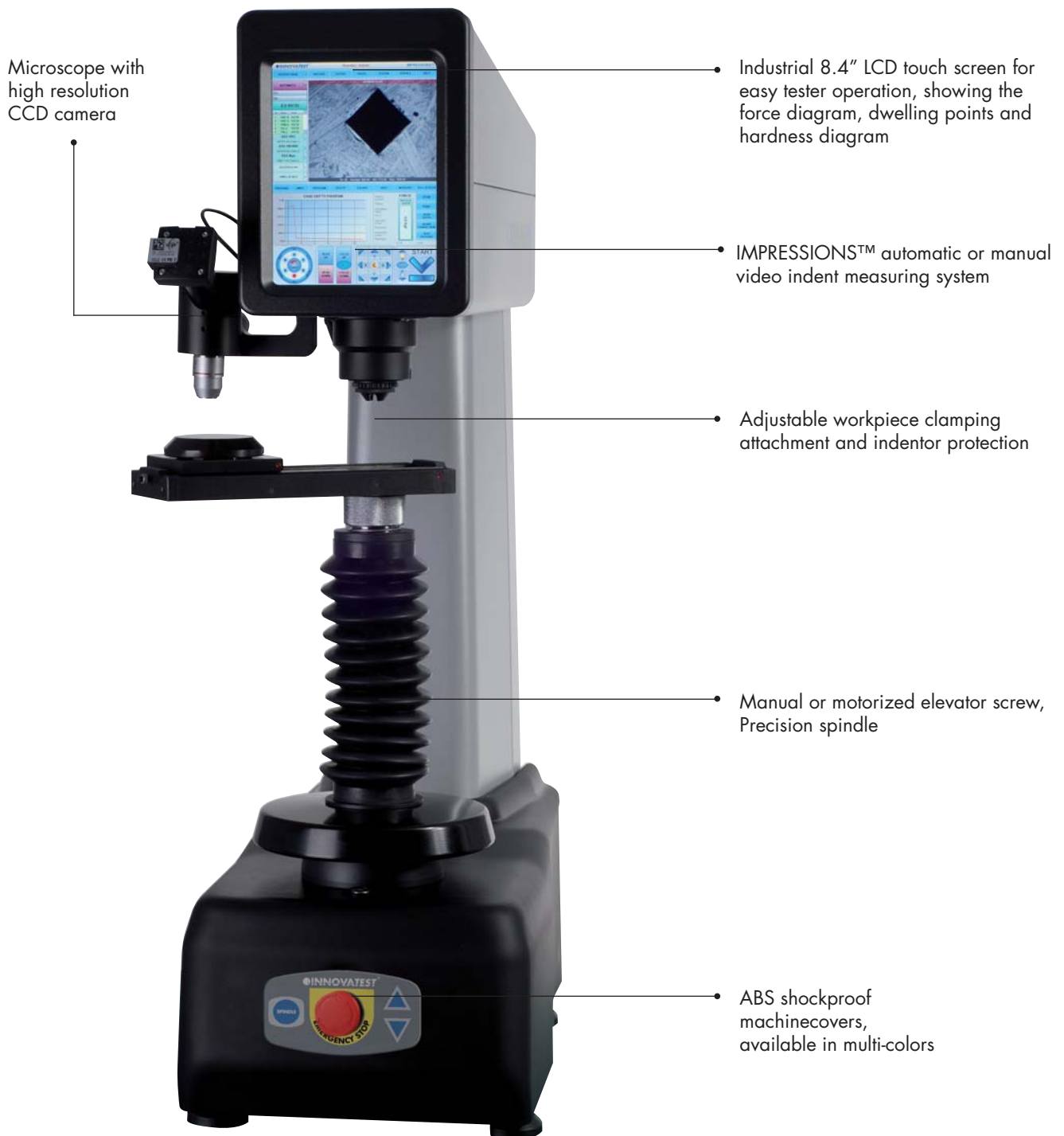
VERZUS 750CCD 1 KGF/9.8N TO 250KGF/2.45KN, BUILT-ON CAMERA